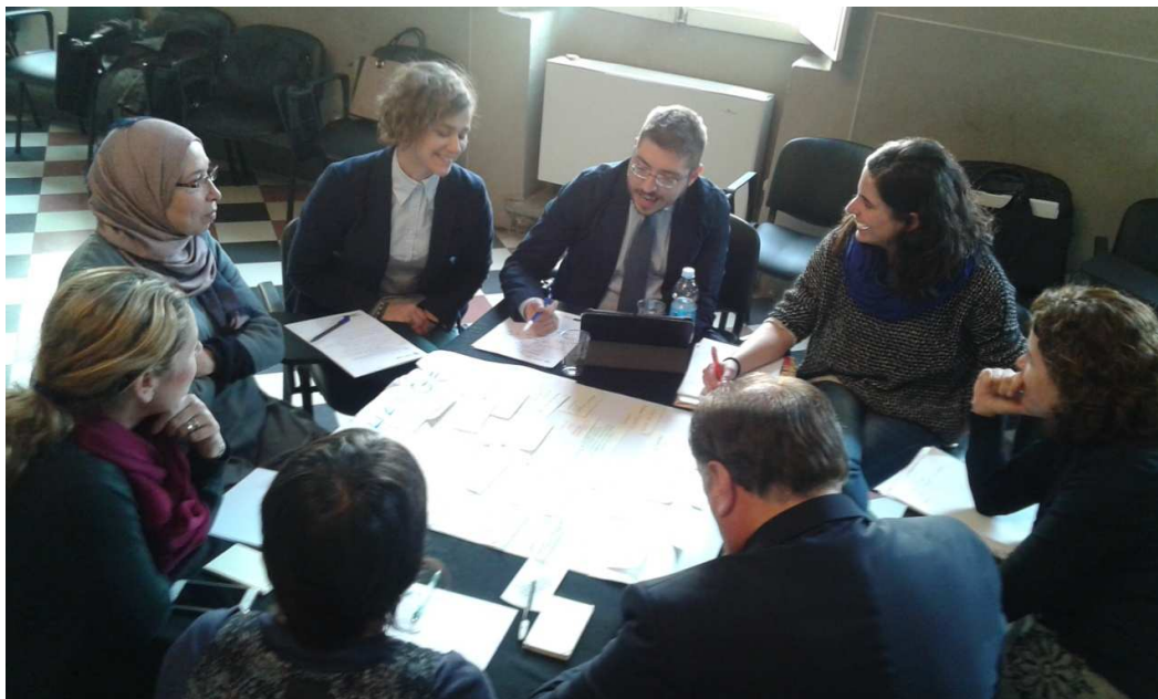
The working group on Exchange

Among the results of the working groups, there is the decision to maintain and strengthen the network created through Egrejob project and whose members are: Egrejob partners, ETEC members, signatories of Green Jobs Charter. This is why the participants took the decision to create a LinkedIn group as a mean to maintain the network and keep on cooperating on the formulation of new projects for the future. The URL of the group is the following: https://www.linkedin.com/groups/8506198 .