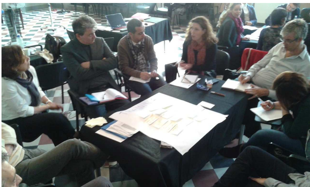
The working group on Training